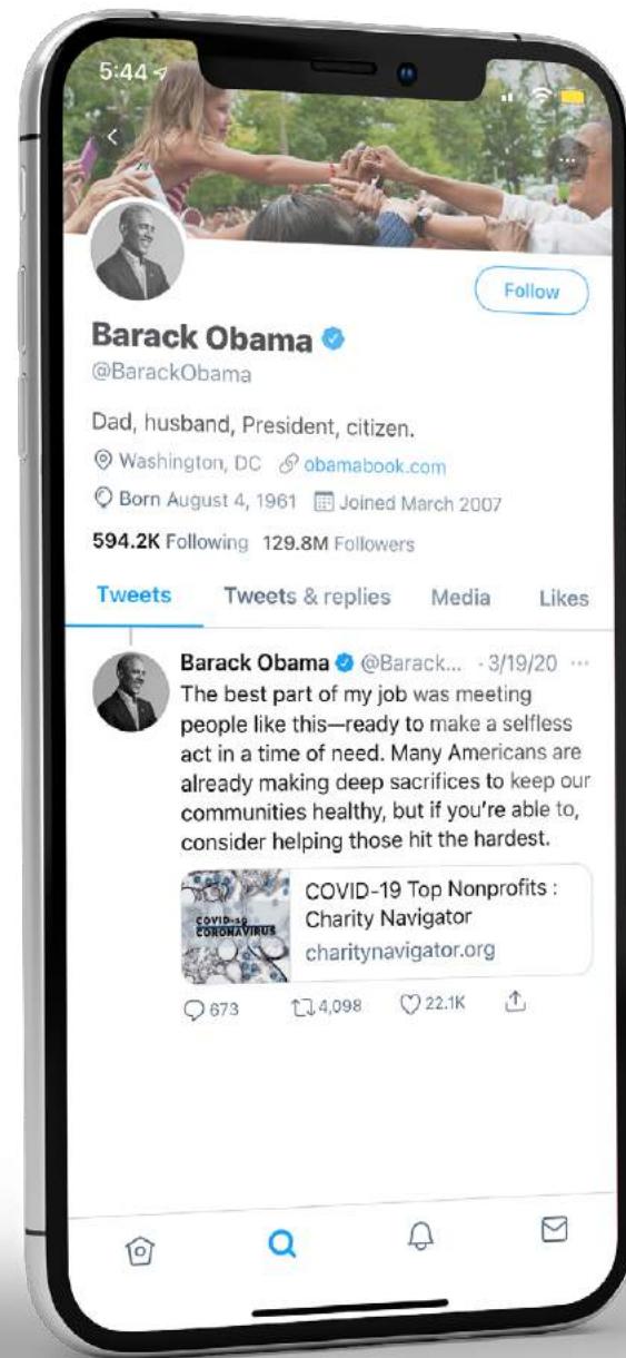
▲ President Barack Obama retweets Charity Navigator's COVID-19 Hot Topic list with message encouraging donor giving for those affected (March 19, 2020).